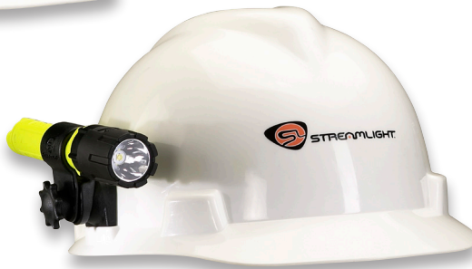
Shown with Dualie 2AA (not included) using slot attachment