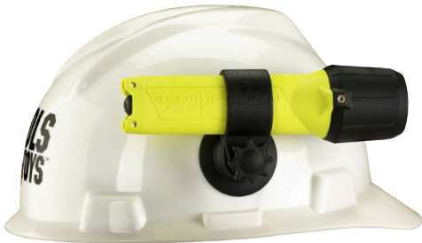
3AA ProPolymer® HAZ-LO®