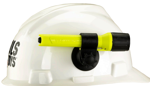
2AA ProPolymer® HAZ-LO®