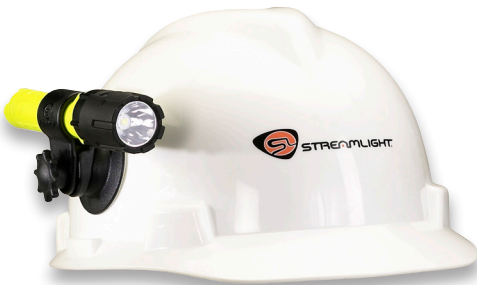
Shown with Dualie 2AA (not included) using adhesive base