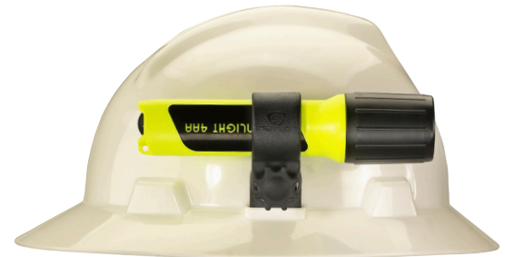
4AA ProPolymer® Lux